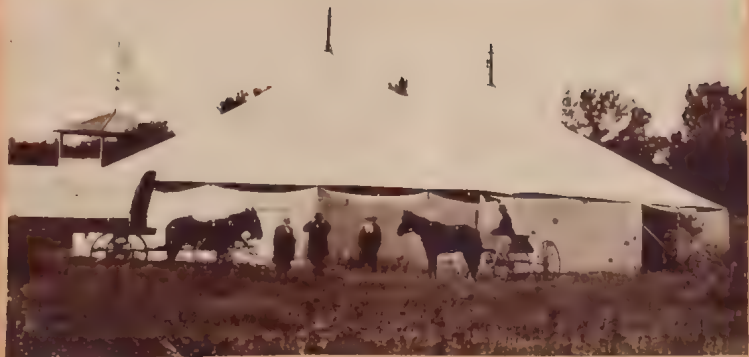
Tent Preaching Kansas